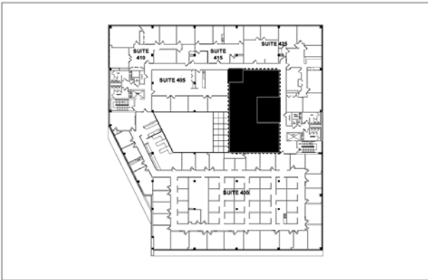
BUILDING PLAN: NTS